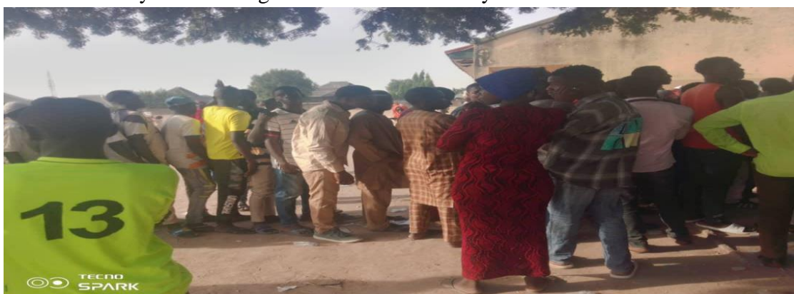
2023 Presidential & National Assembly Election process ongoing at Sangere Primary School PU in Girei LGA, Adamawa State

Nigeria has held 7 consecutive general elections since the return to civil rule in 1999. Centre LSD since its inception in 2010 engaged the electoral process including observations beginning with the 2011 general elections. The Centre has a pool of over 454 volunteers across Nigeria, among which it draws for its observation efforts. It successfully observed the 2023 Presidential & National Assembly general elections that held on Saturday February 25th, 2023. It also observed the off cycle Gubernatorial elections in Bayelsa and Kogi states held on Saturday 11th November 2023.